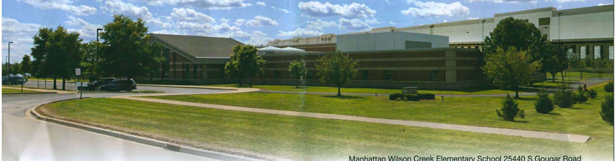
Manhattan Wilson Creek Elementary School 25440 S.Gougar Road For illustrative purposes only. Image not to scale.

Will Manhattan determine what its residents see when they look to the west toward the Northpoint development?