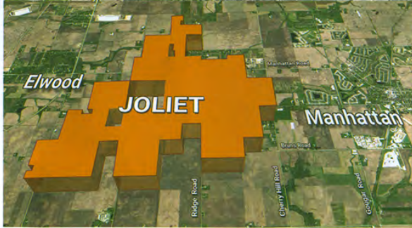
Without Manhattan's participation, Joliet can control the entire Compass Business Park.